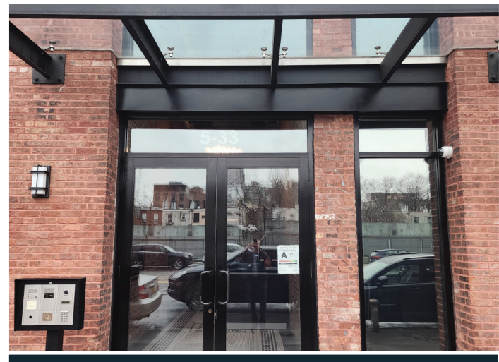
NEW STOREFRONT ENTRANCES AND LOBBYS!