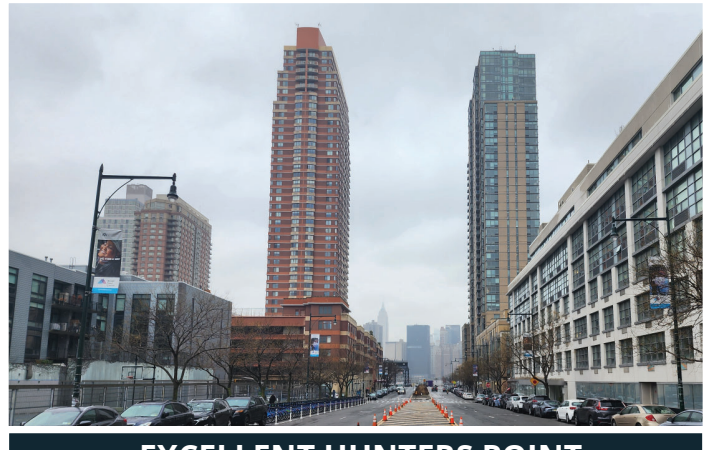
EXCELLENT HUNTERS POINT LOCATION!